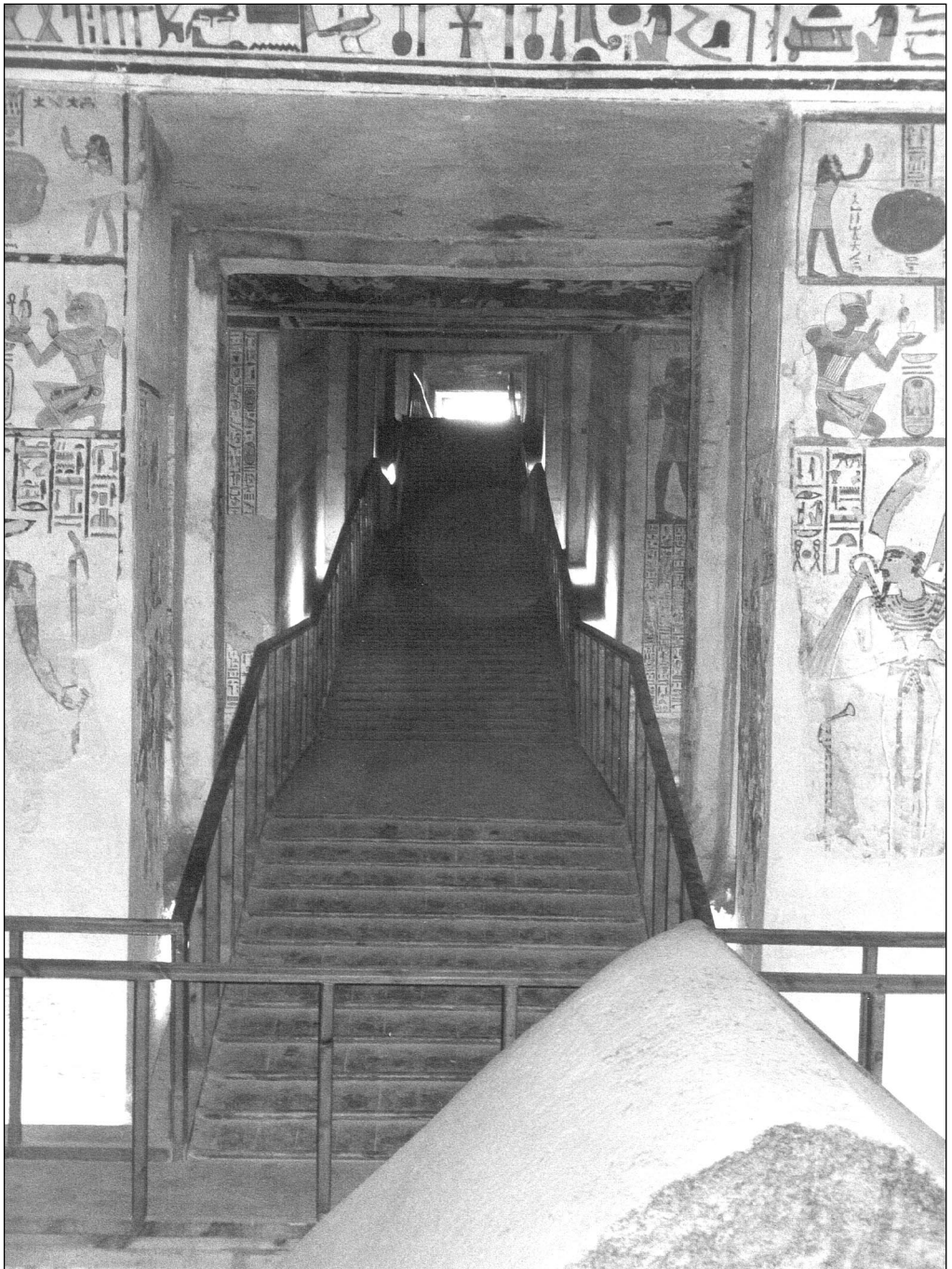
Fig. 1. Interior of the tomb of Ramesses VI